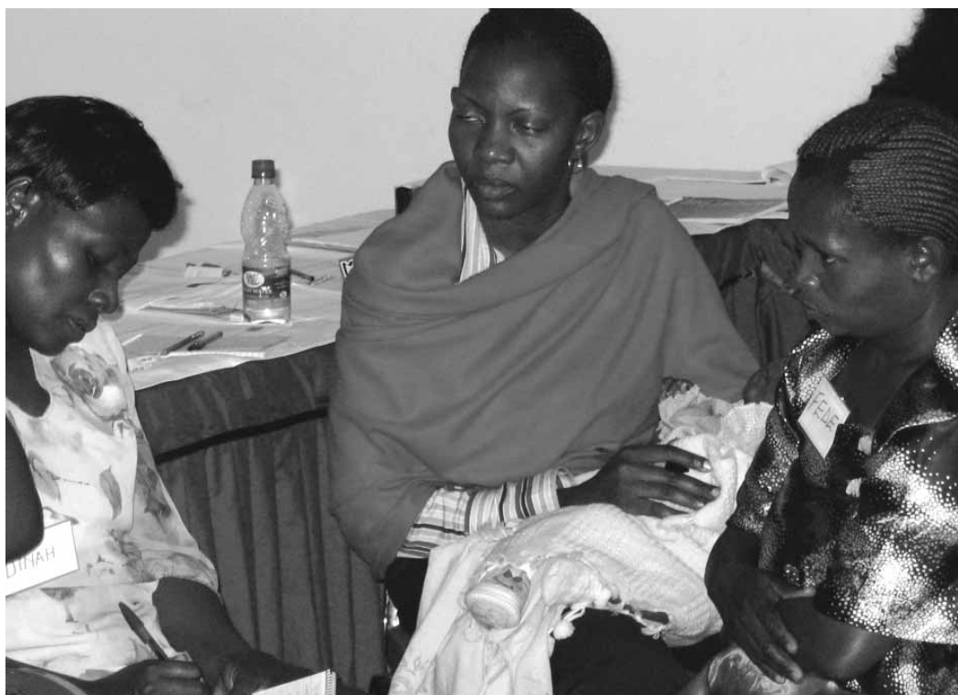
An interpreter, a participant and a workshop facilitator discuss story content.

summaries of their fistula stories and had the opportunity to hear and ask questions about the proposed workshop agenda. Most importantly, they were each given a disposable camera and shown the basics of camera use: looking through the viewfinder, framing the object to be photographed and finding and pressing the correct button.